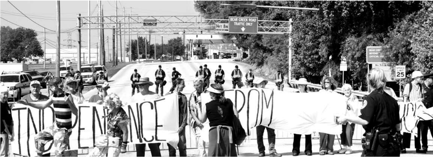
As the Clown Army retreats, stage right, 22 banner holders stay put, blocking the state road leading into Y-12.

For more information, contact the Oak Ridge Environmental Peace Alliance (OREPA), which has been engaged in protest and civil resistance at Y-12 for over 20 years, at orep@earthlink.net , or visit their website, www.stopthebombs.org . More photos, reports and video of the action can be found at the Nuclear Resister blog, www.nukeresister.org .