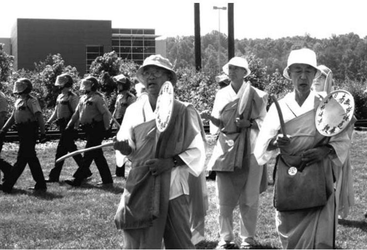
Brute force vs. truth force. State police were dispatched in formation, as monks and nuns of the Nipponzan Myohoji Buddhist order chanted for peace.

On the morning of July 5, more than two hundred people went to the Y-12 nuclear weapons complex in Oak Ridge, Tennessee for a rally and nonviolent direct action declaring independence from nuclear weapons. The group, which had been together over the July 4th weekend for the Resistance for a Nuclear-Free Future gathering in nearby Maryville, breakfasted on fresh local berries and bagels, while listening to music, poetry and a skit.