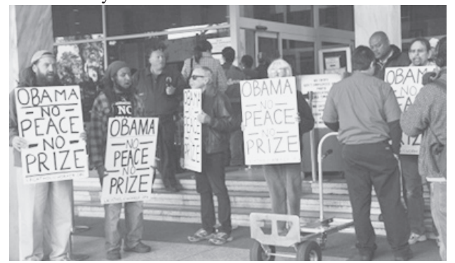
Los Angeles Catholic Workers block the entrance to the federal building in Los Angeles, California.

mediately transported to the hospital after being arrested. He was released several hours later with a pulled muscle, a sprained elbow and a torn ligament. The six were cited for disorderly conduct and released.