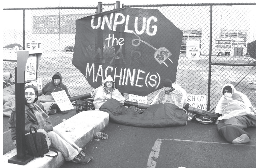
Blockaders arrived before dawn, outwitting police and shutting down the National Robotics Engineering Center in Pittsburgh, March 2, 2007.

First Thursday die-in and blockade of Federal Building.