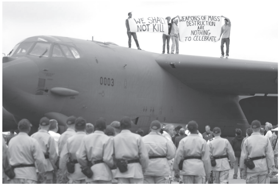
Sailors at Oceana Naval Air Station stand in shock and awe of peaceful civilian iconoclasts.

Such realities would have upset what was essentially a religious event. Faith in the weapons was palpable. The aircraft were heralded as the source of freedom and security, peace and prosperity. These attributes of a deity were readily assigned to the warplanes, the airborne idols of our national religion, militarism. In the end it is our B-52's and F-18's and our stealth fighters and bombers that we believe will save us. We entrust our children to their protection, swell with pride when they join the ranks in their service, and freely give our money to create ever more lethal versions. This is the message of the air shows; life as we know it is made possible by these planes and we owe them our