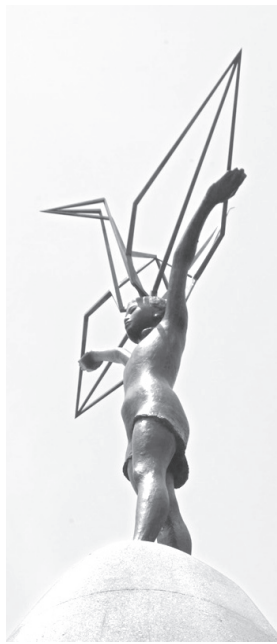
Children's Peace Memorial (detail), Hiroshima

At the same time, four demonstrators went to the freeway overpass near the Trigger Avenue entrance and held a banner stating "Abolish Nuclear Weapons" and a U.S. flag. When deputies arrived about 30 minutes later,